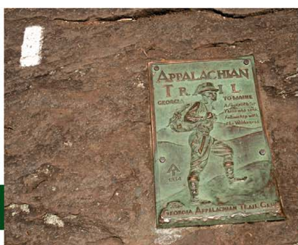
The first blaze in Georgia on Springer Mountain